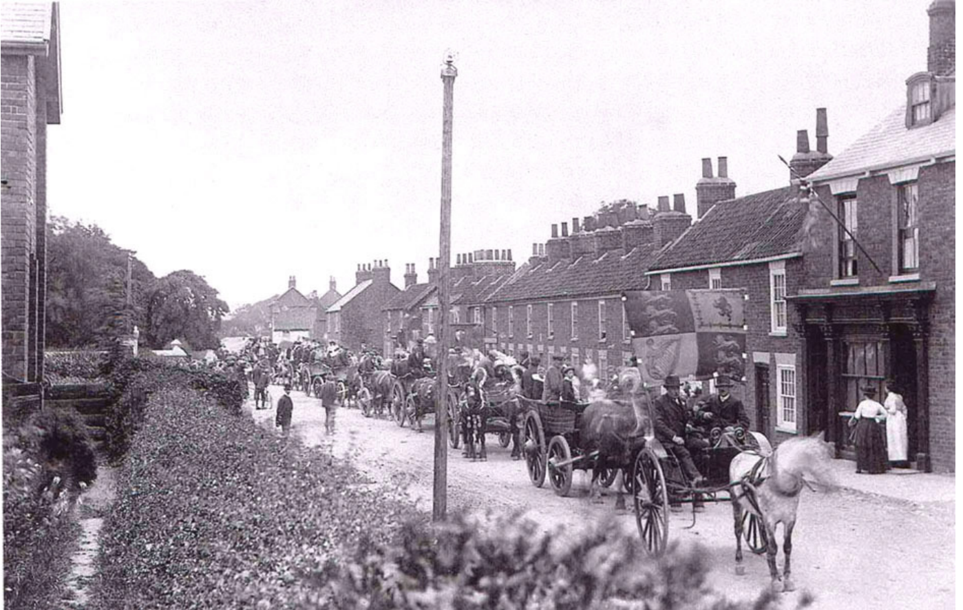
Street procession in Roos, probably to celebrate the coronation of George V in 1911

This is one of the photographs that Stephen Foster has available. There wasn't time after all to include more in this 100th issue. Another time.