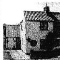
(Slightly edited for space.) Roach Cottage South End, Roos.